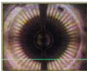
After Aqua Freed Treatment